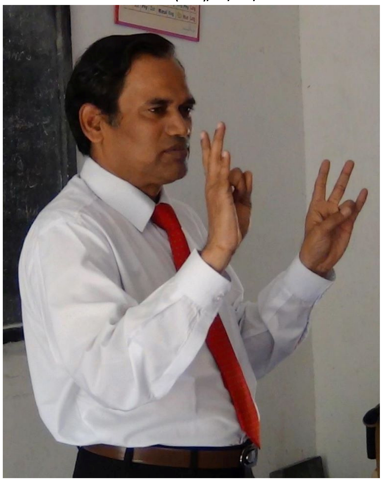
ANNUAL REPORT (Apr 2014 – Mar 2015)